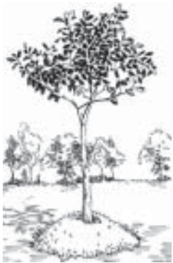
Bad ("volcano") mulch.